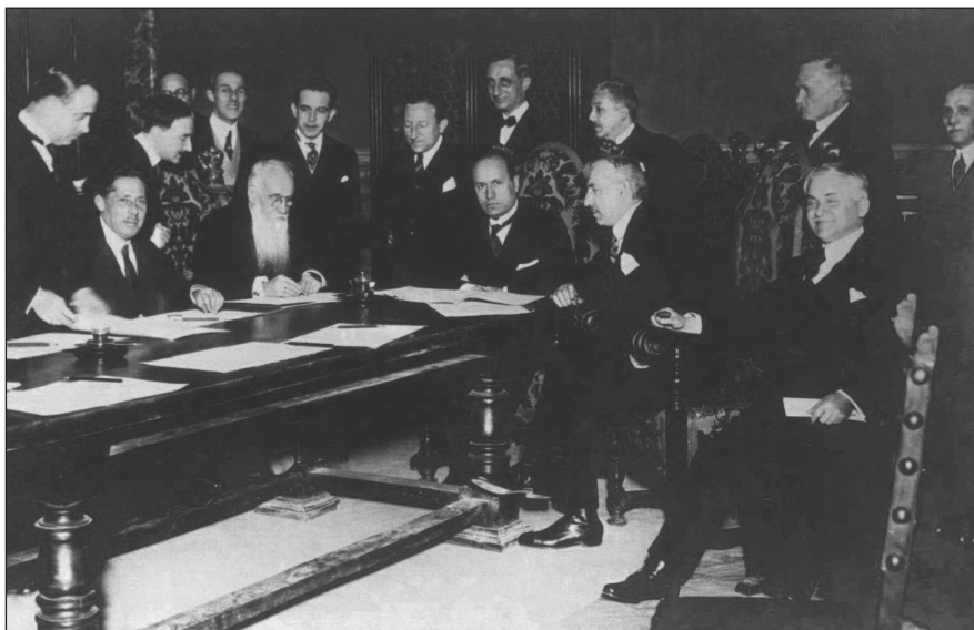
Nikola Pašić and Benito Mussolini sign the treaty of friendship (the Pact of Rome) on 27 January 1924

ship agreement with Belgrade would have the advantage of forcing it to be more amenable to advice of moderation from Paris. 101